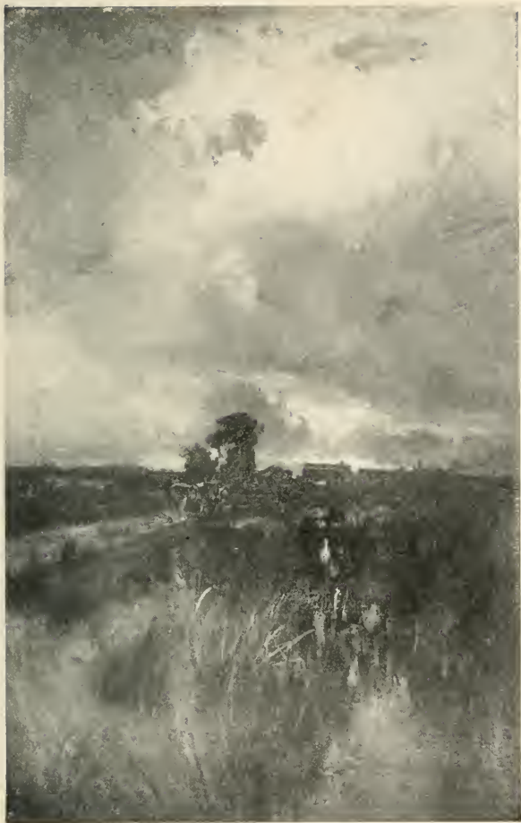
Now fades the glimmering landscape on the sight